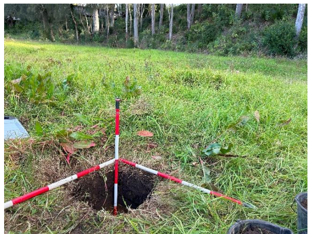
Figure 26: Location of Test Pit 5, view south-west