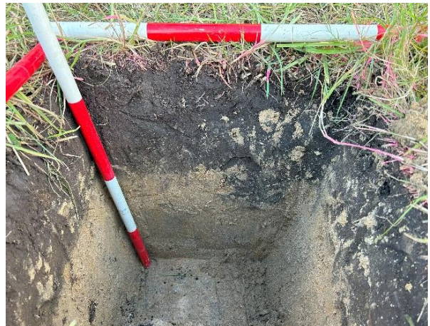
Figure 30: Profile view of Test Pit 7