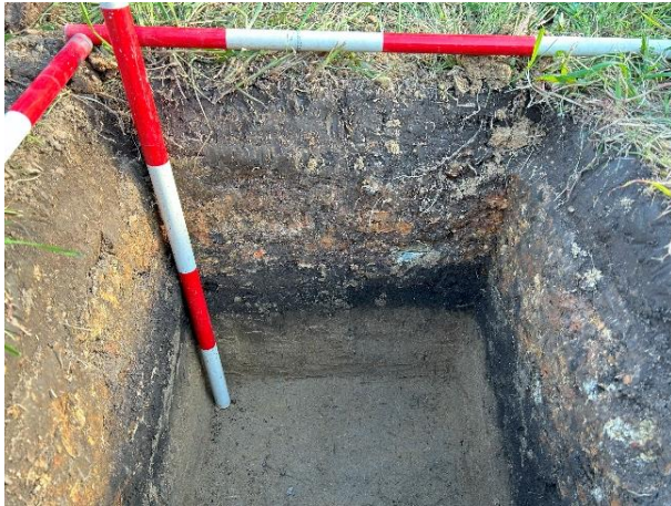
Figure 27: Profile view of Test Pit 3 showing layer of historic fill above natural soils