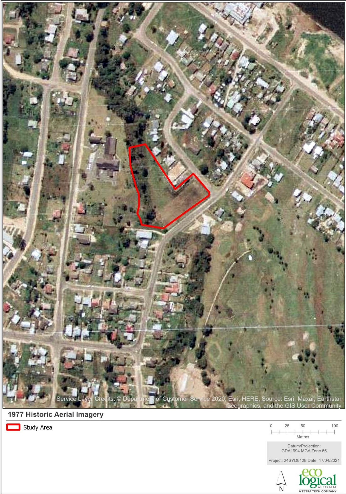
Figure 6: 1977 historic aerial of study area