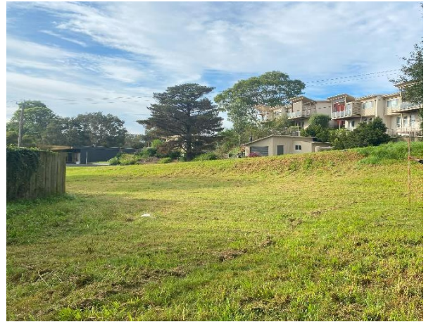
Figure 17: View south towards Bavarde Avenue showing modified landform