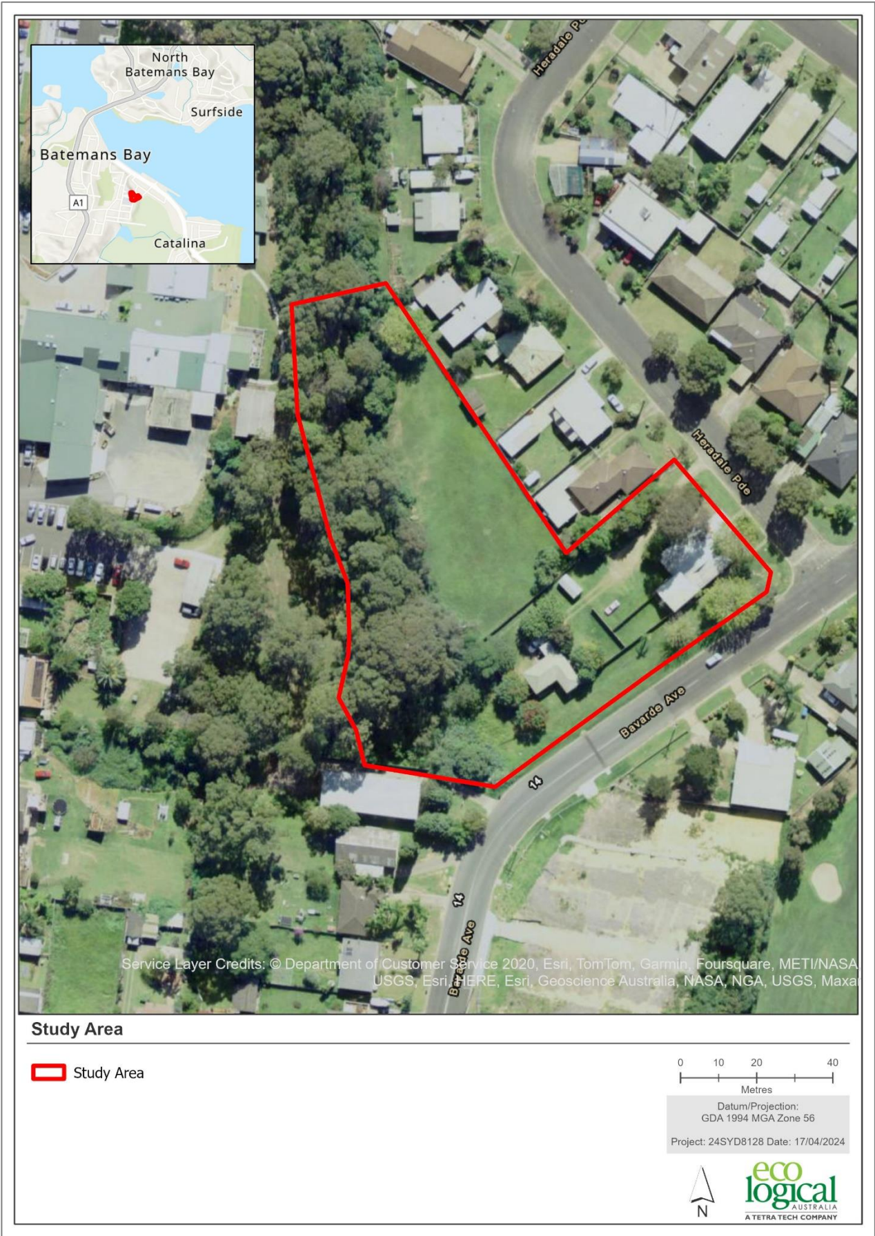
Figure 1: The study area, 20 Heradale Parade