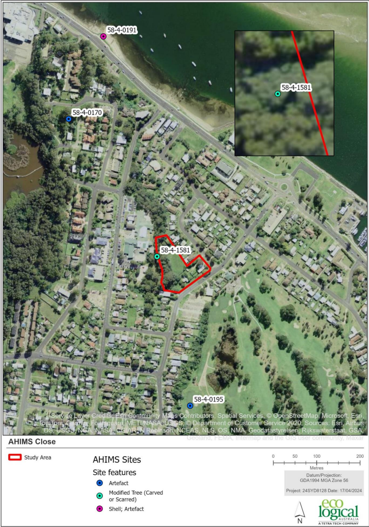
Figure 8: Registered AHIMS sites within proximity to the study area