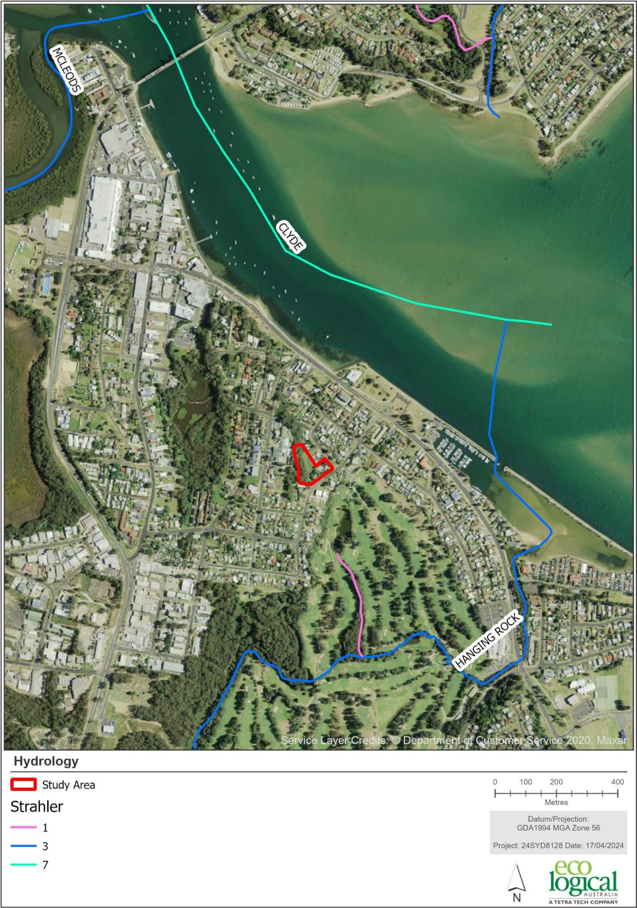
Figure 4: Hydrology within the study area