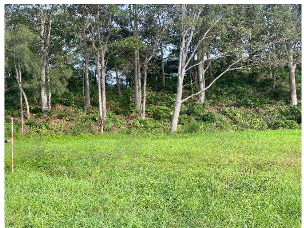
Figure 15: View west showing dense grass cover and remnant trees along steep slope along western boundary of study area