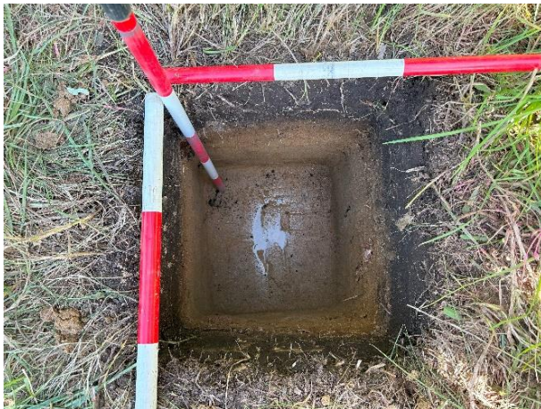
Figure 21: Plan view of Test Pit 1 showing damp water table at base of pit