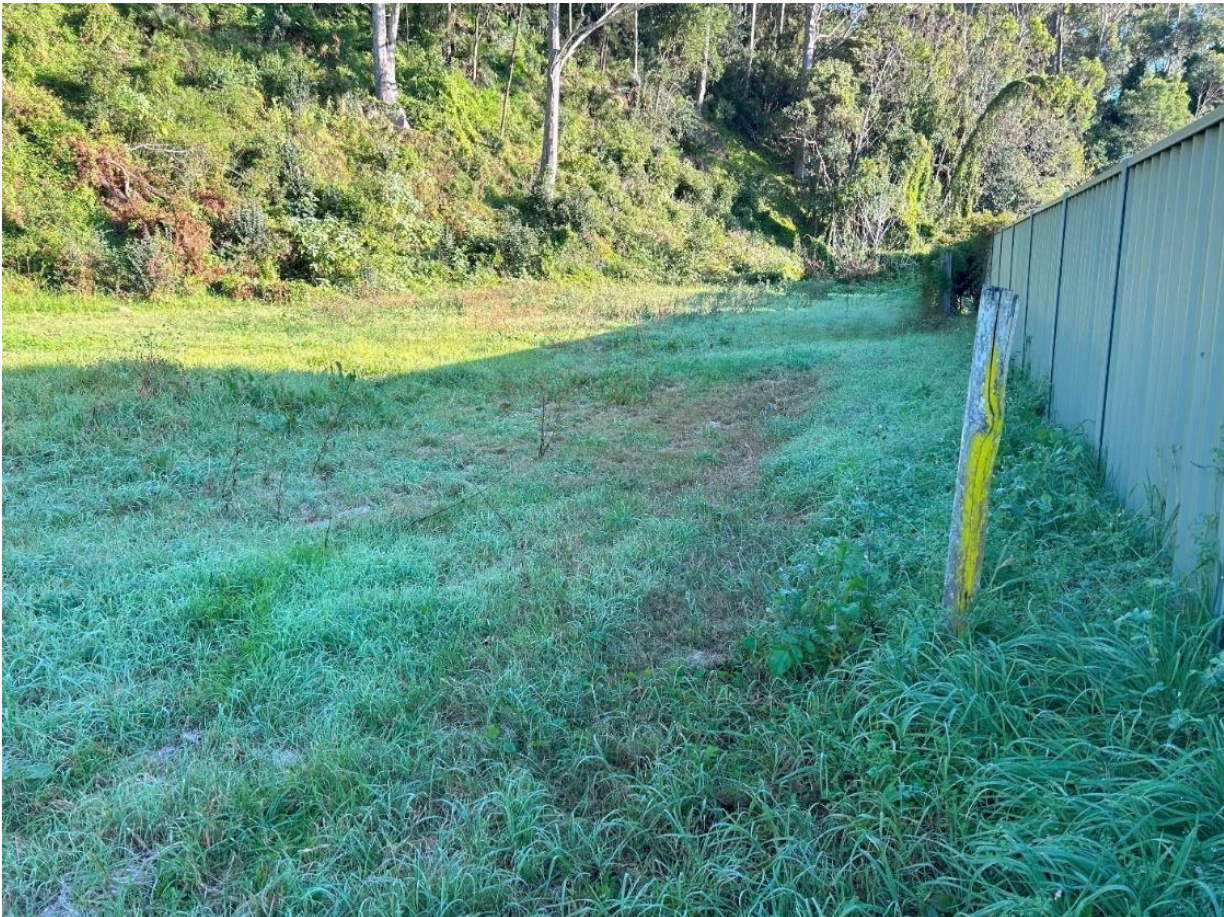
Figure 20: View north showing surface disturbance from activities undertaken between survey and test excavations.

Cultural contributions during the test excavation also indicated that whilst the study area was likely to have been used as a short term campsite, it had previously been ploughed and utilised as a horse paddock (c. 1930s), and several test pits displayed some degree of disturbance from historic land use. The remainder of the test pits contained relatively intact soil profiles. The following section presents a summary of the test excavation results.