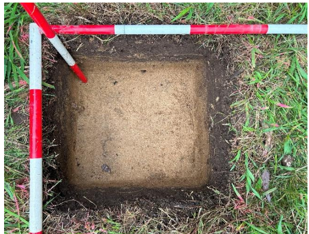
Figure 32: Plan view of Test Pit 10