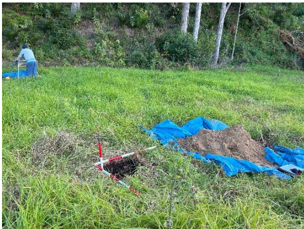
Figure 31: Location of Test Pit 7, view north-west