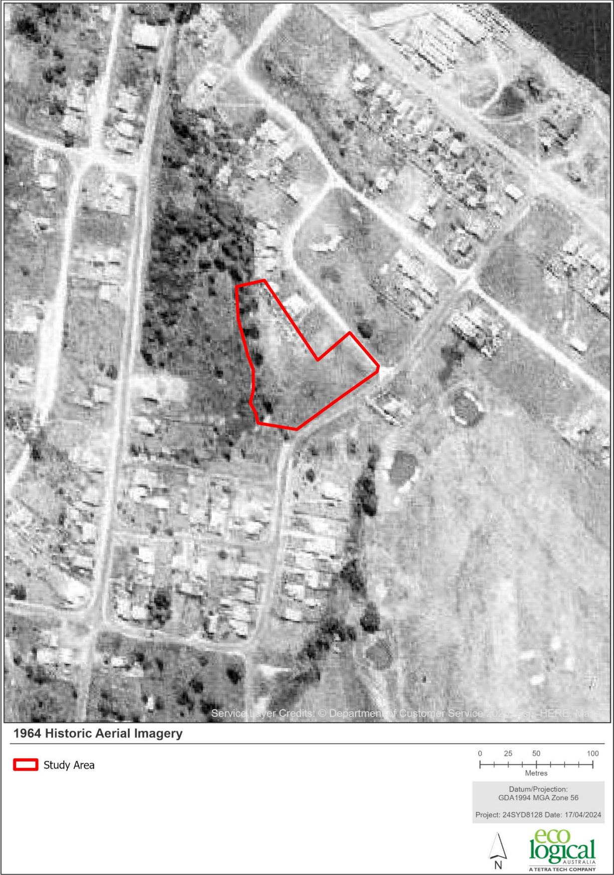
Figure 5: 1964 historic aerial of study area