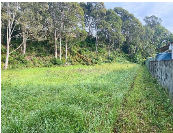
Figure 14: View north showing dense grass cover in northern portion of study area and remnant trees along steep slope along western boundary