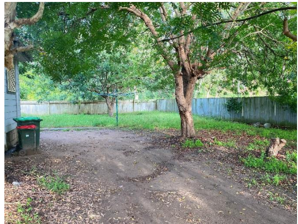
Figure 13: View west showing disturbance in south-eastern corner of study area