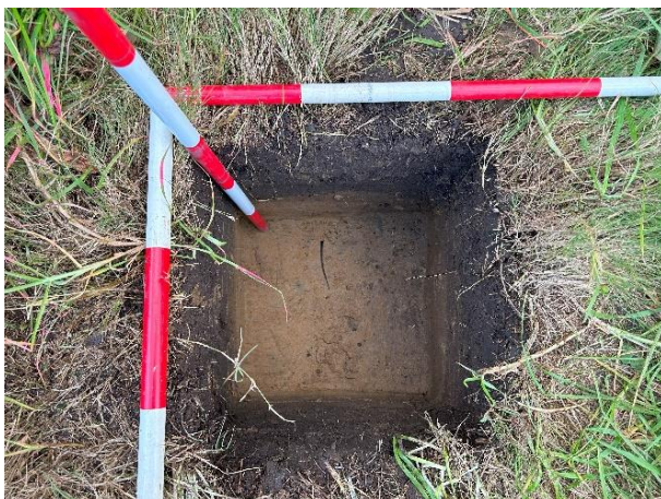
Figure 25: Plan view of Test Pit 5