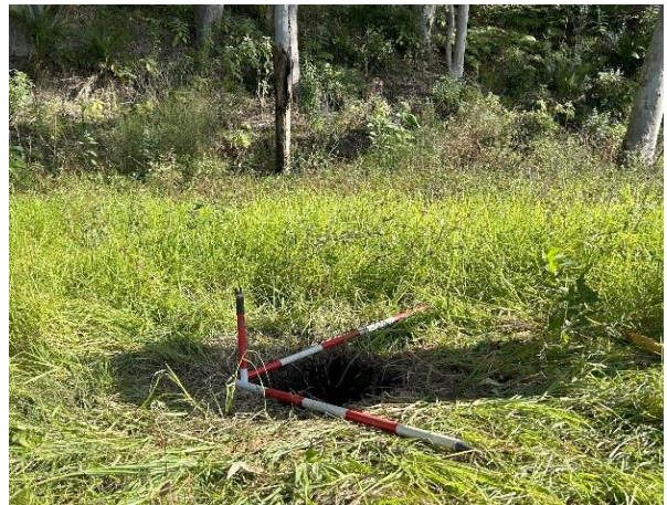
Figure 22: Location of Test Pit 1, looking north-west