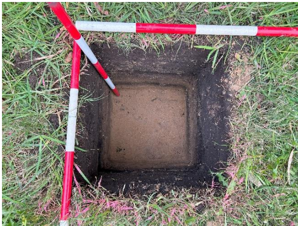
Figure 35: Plan view of Test Pit 12