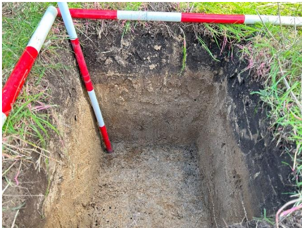
Figure 29: Profile view of Test Pit 5