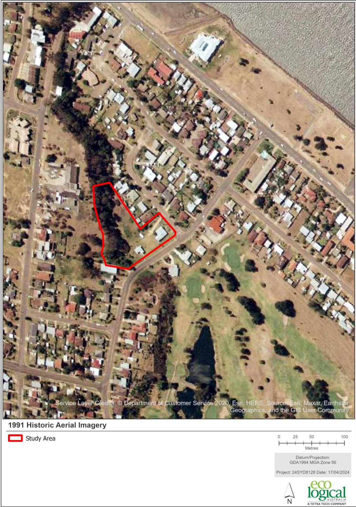
Figure 7: 1991 historic aerial of study area