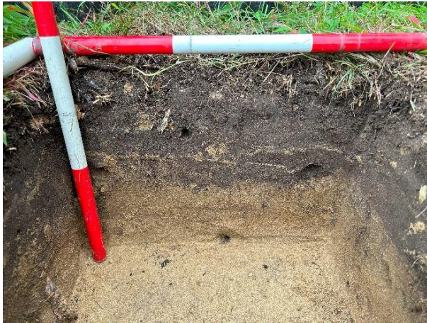
Figure 33: Profile view of Test Pit 10 showing shallow soils and clear transition to marine beach sand layer