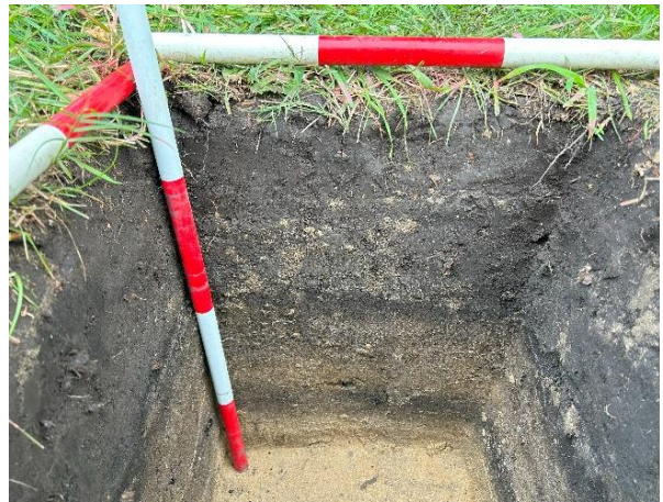
Figure 36: Profile view of Test Pit 12 showing layer of historic fill in topsoil