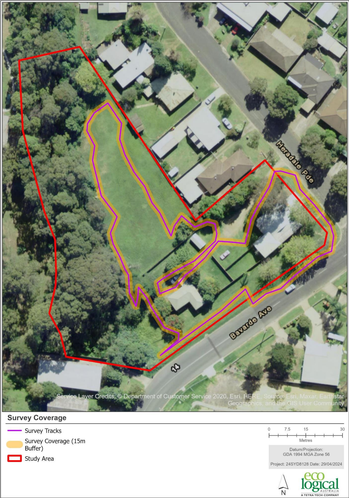
Figure 18: Survey coverage and tracks for the study area