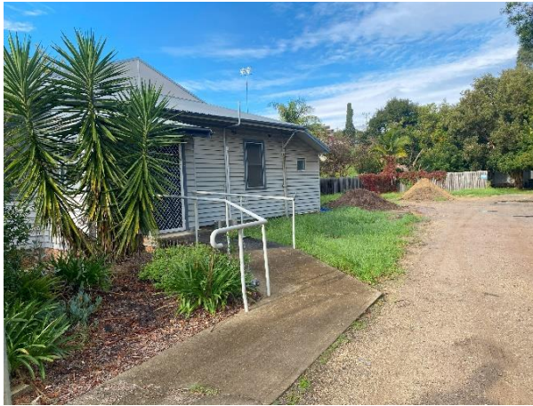
Figure 10: View west from south-eastern corner of study area, showing single storey residence and modified gravel driveway