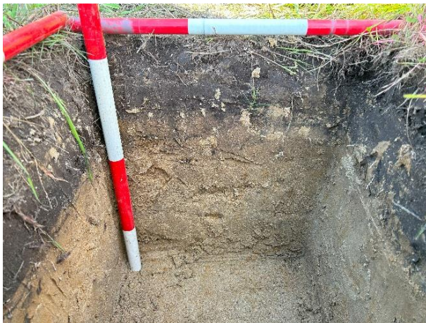
Figure 23: Profile view of Test Pit 2 showing clear boundaries between topsoil (A Horizon) and marine beach sand layer (B Horizon)