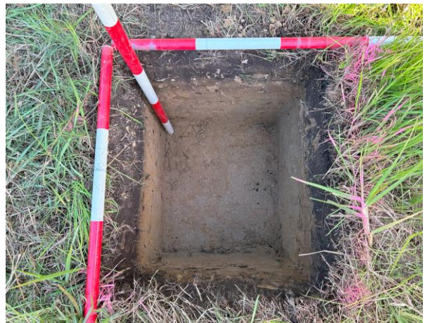
Figure 24: Plan view of Test Pit 2