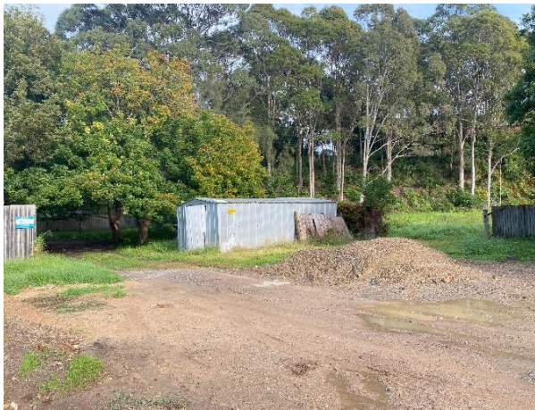
Figure 12: View north-west showing gravel driveway, remnant trees and mixed deposits of orange-brown sandy loams, gravel and rock