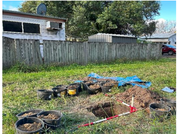
Figure 28: Location of Test Pit 3 along fence line, view south-east