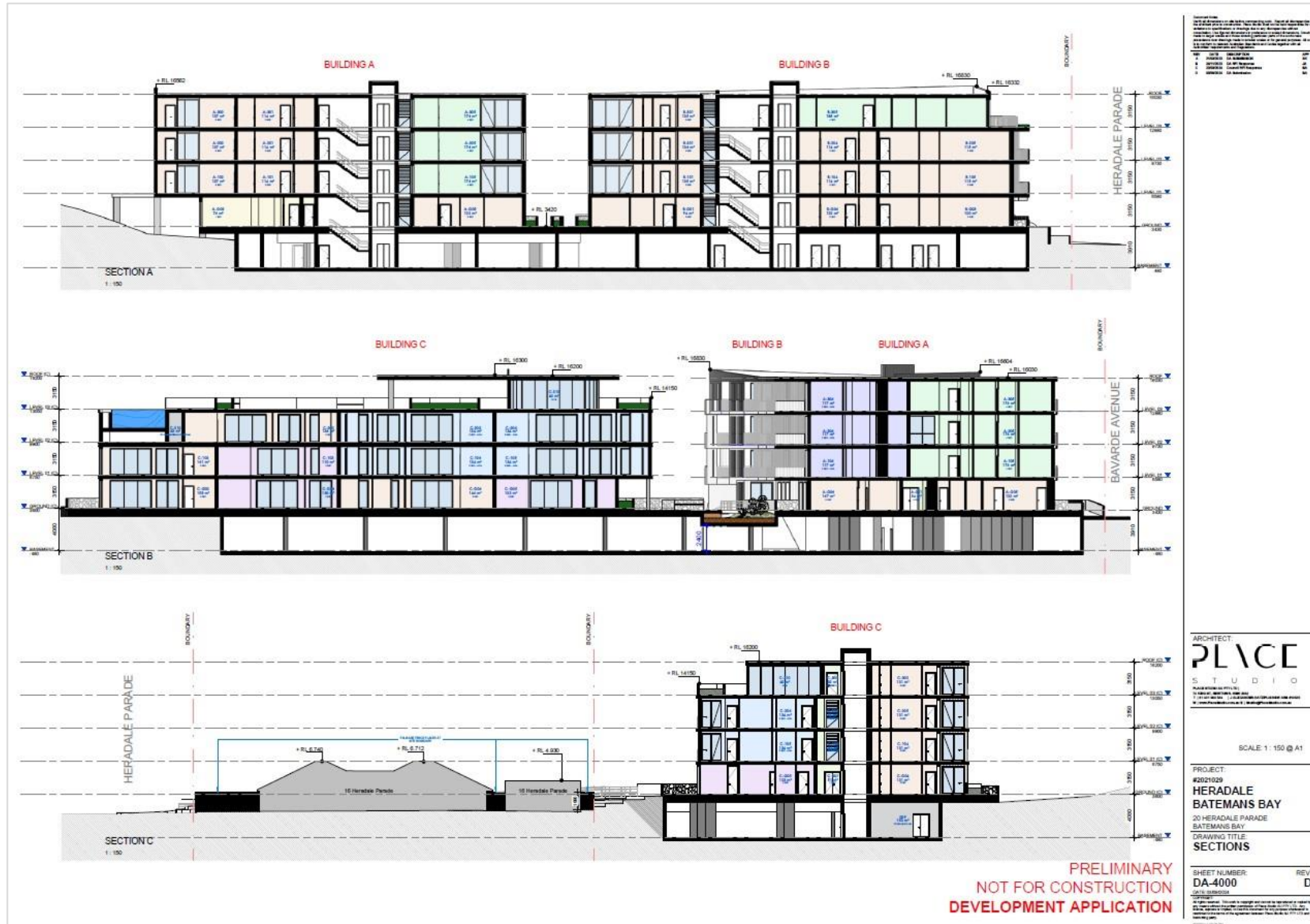
Figure 3: Section plan of the proposed works