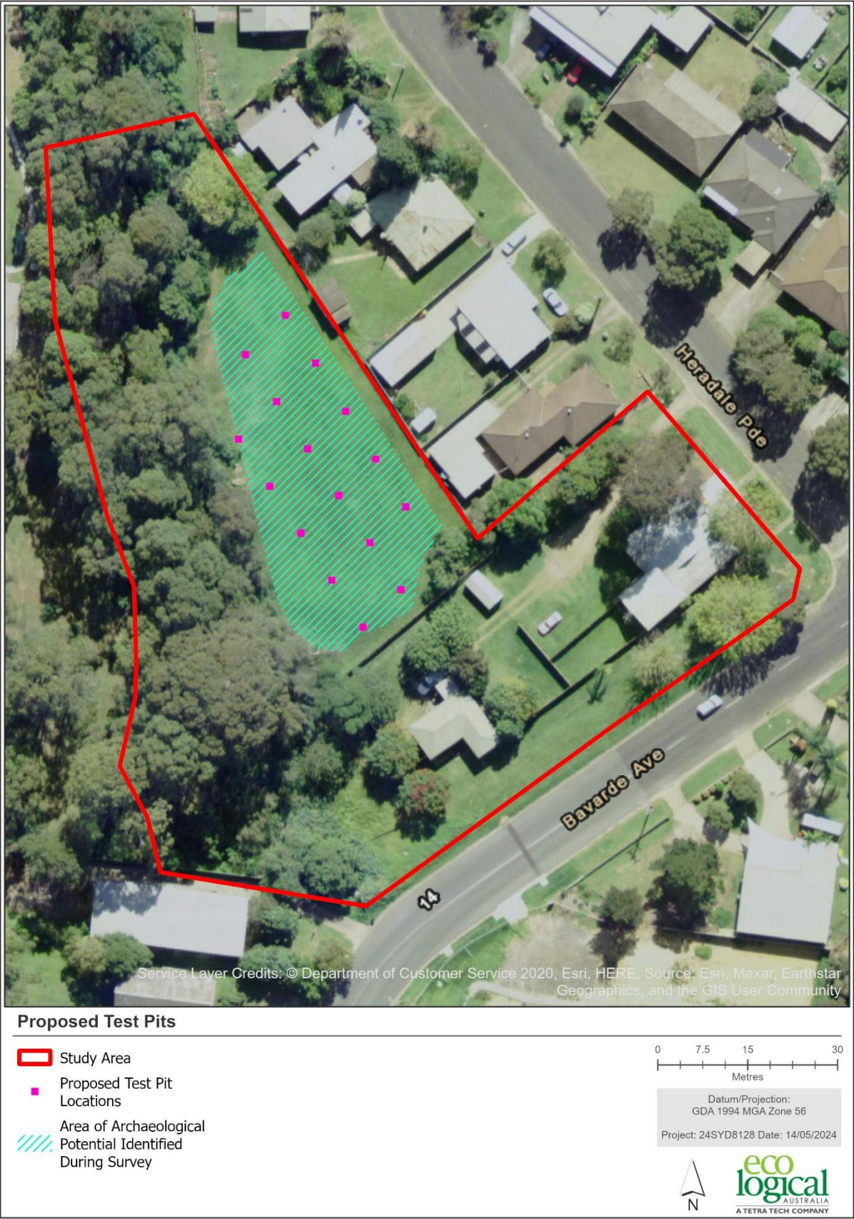
Figure 19: Areas of potential identified during the survey for the study area and proposed test pit locations