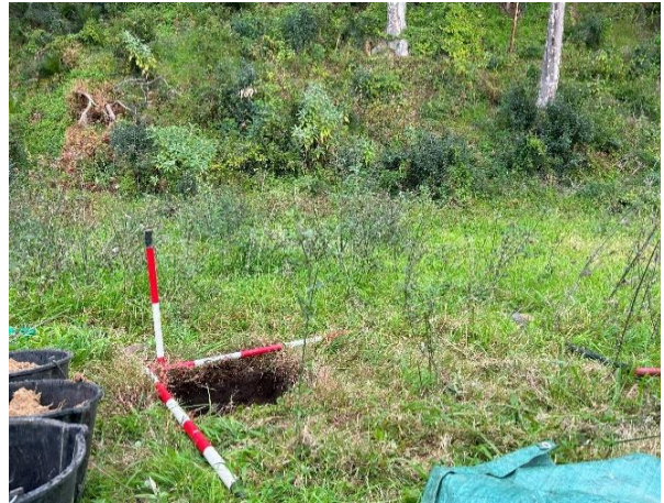
Figure 34: Location of Test Pit 10, view west