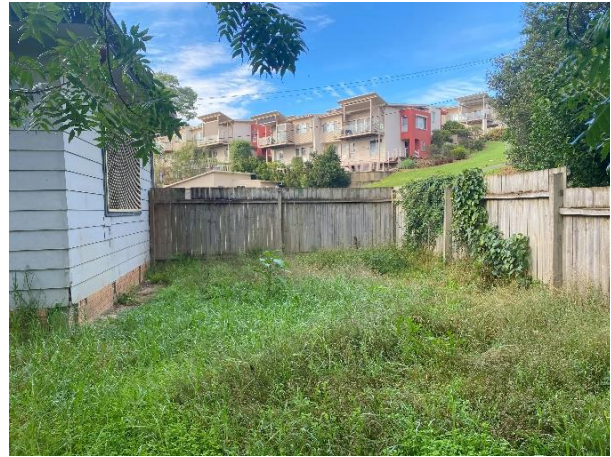
Figure 11: View south towards Bavarde Avenue from south-eastern corner of study area, showing single storey residence, fencing and dense grass in backyard