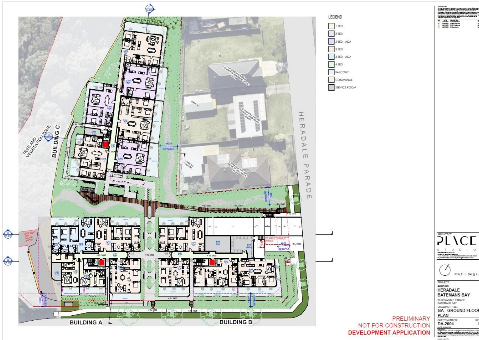
Figure 2: Ground floor plan of the proposed works