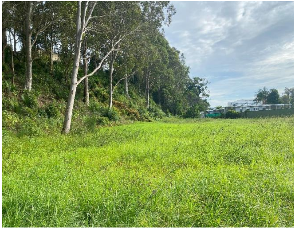
Figure 16: View north showing relatively undisturbed landform and dense grass covering northern portion of study area